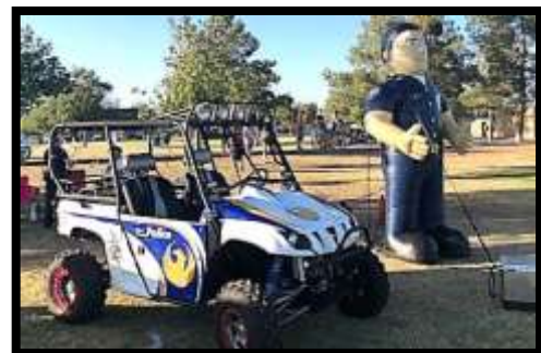
The PHX PD RZR