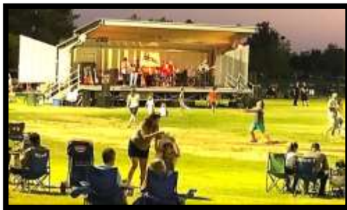
Music & Entertainment by Big Zephyr