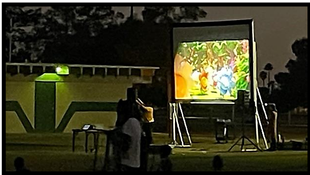
SING 2 was shown