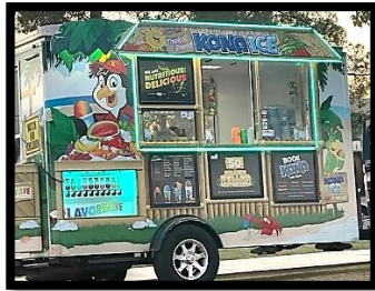
Kona Ice, yum!