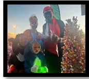
The Lollipop Tree!