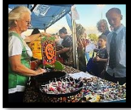
Candy Wheel of Fortune!