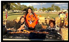
Pumpkin Patch and Hay Bale Maze