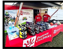
65 Children's Bike Helmets were given out!