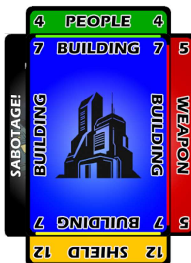
A Sabotage card, and a sabotaged building.

When a Sabotage card is revealed, the following happens: