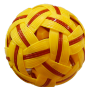
Women | Junior