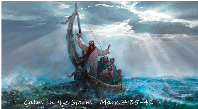
Calm in the Storm | Mark 4:35-41