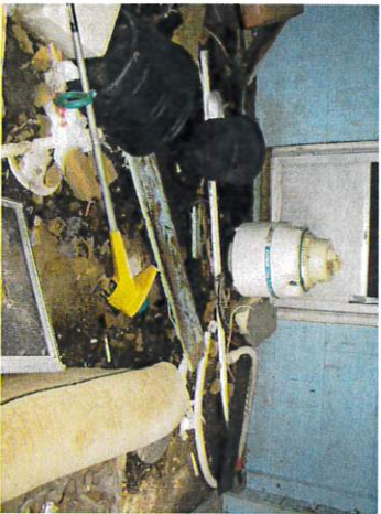
Dilapidated Dwelling - 101 Jerry Lynn Drive