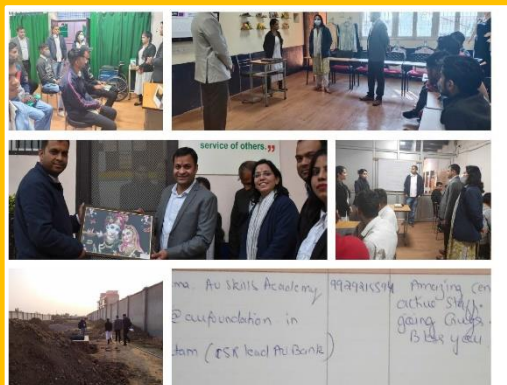
CSR Team of AU Small Finance Bank Visit.