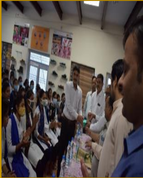
Mera SEDI Mera Sehyog