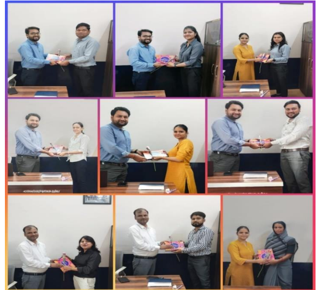
Celebrated Trainer's Day 24 Aug 2022