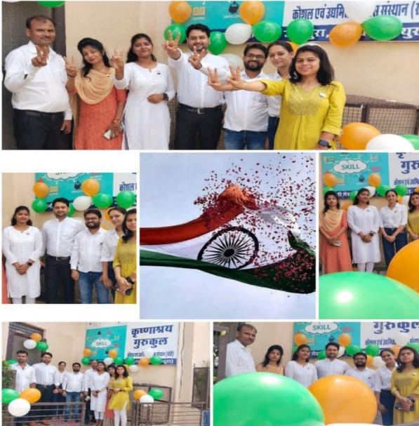
Celebrated 75 th Independence Day 15 Aug 2022