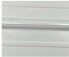
Brilliant White (14)