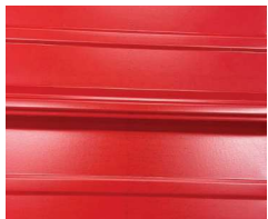
Crimson Red (3)