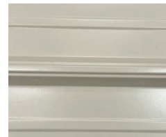
Light Stone (10)