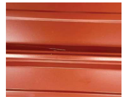
Rustic Red (9)