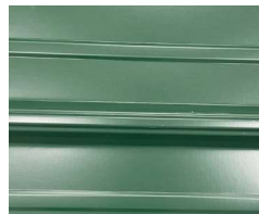
Hunter Green (7)