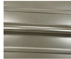
Burnished Slate (2)