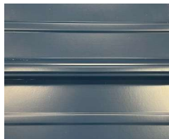
Gallery Blue (6)