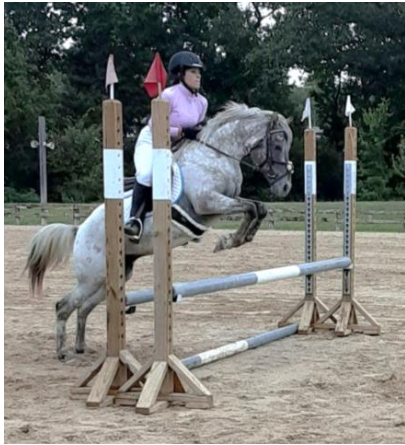
Smoke & Mirrors, HOA-1981