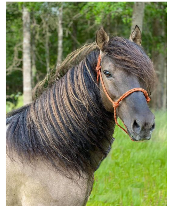
Barrier Island Daylight, HOA-2329

Dedicated to the preservation of the Colonial Spanish Horse