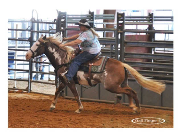
Reserve - Baby Driver/Zack McVicar