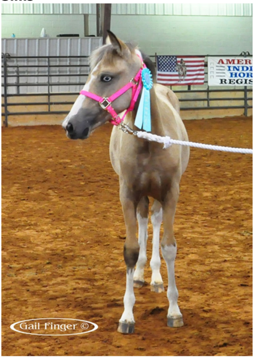
Reserve Broken Color – Choctaw Cactus Queen/Susan Beecroft