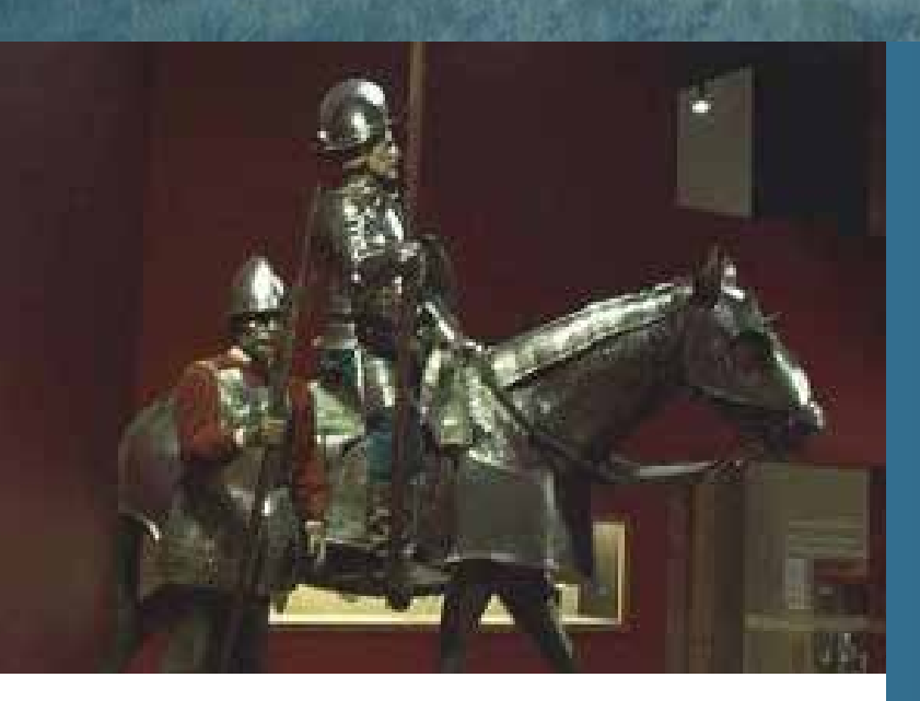
Photo: Display of Conquistador armor in the Albuquerque Museum of Art and History.