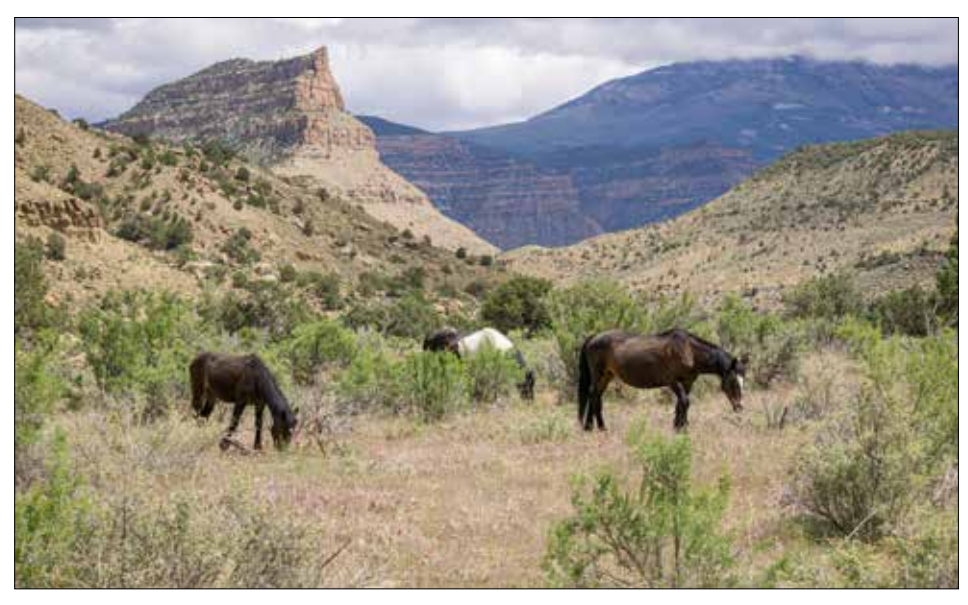
Photo: Wild Mustangs in Little Book Cliffs