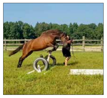
Photo: Kelly Anders training with Lyrical Moment (HOA Registration Pending).

Calm. Don't get all hyped up. Quiet confidence is what everyone looks for when they are in a stressful situation.