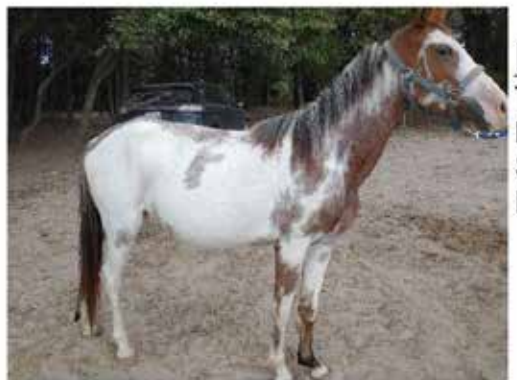
Little Thunder Girl

Tobiano Medicine Hat Mare Foaled 2017 By Dakota Tears out of Special's Little Missy Started under saddle, very calm and easy going HOA #2150