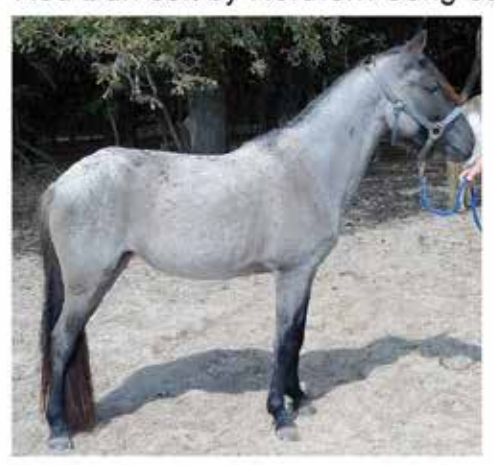
Blue's Heather Breeze

Blue Corn Roan Mare Foaled 2017 By Rigaleto's Something Special out of Misty Blue Moon Rising Started under saddle, willing with brio. HOA #2149