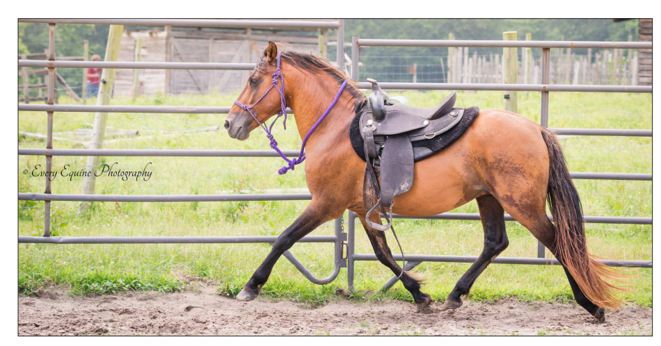
Photo: Scoundrel Days (HOA-1313, Rowdy Yates/Lucinda), Classic-size Grand Canyon Strain stallion, in 2017.