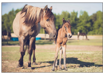
Photo: (left to right) Midnight Storm and Midnight Rain Dancer.

Two years ago, I brought my very first Spanish Mustang home, an 18-year-old grulla mare named Midnight Storm (HOA-2206, Native Winds Palouse Thunder/Native Winds Midnight Festival). Shortly thereafter, my family grew to include Prairie Snow Dance