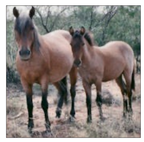
Photo: The Standard-sized Grand Canyon Strain mare Fewie (HOA-1041, Little Chief/Babe), and Donna Anita (HOA-1227), her Classic-sized daughter by Barbwire (HOA-B-041, Snipper/OCI).

standing taller than 13.2 hands are called "Standard" size. Even Standard Grand Canyon Strain horses rarely stand taller than 14 hands.