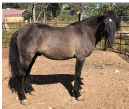
Asad in October 2021

When I finally found a longeing cavesson that came close to meeting my criteria for humane head gear, it came with an “ergonomically”-designed headstall. I wanted the cheek strap that prevented the headstall from sliding into the horse’s eyes and the padded noseband without chains, cables or metal plates inserted. It wasn’t until I was putting the new headstall on my Colonial Spanish stallion Asad that I realized I had a problem.