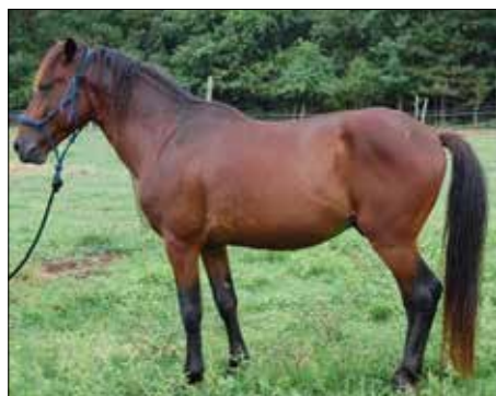
Photo: CWH Stitch, HOA #2096; 100% Corolla Island/Outer Banks, North Carolina