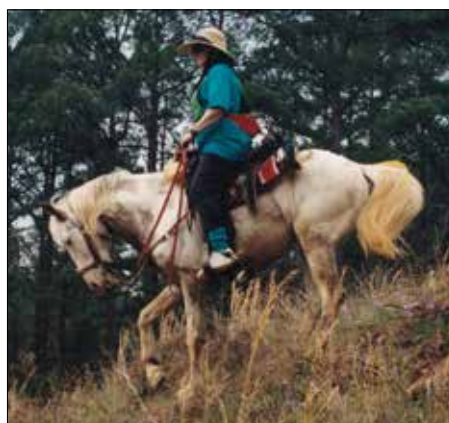
Photo: Choctaw Sun Dance, SMR #1282; 50% Choctaw/Gilbert Jones Foundation, 50% Huasteca