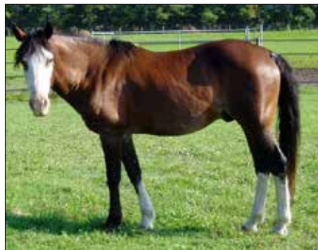
Photo: Wayward Wind, HOA #1751, SMR #1599; 37.5% Book Cliffs, 25% Cheyenne; 12.5% Brislawn; 12.5% Sulphur Mountains, 12.5% Choctaw