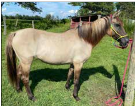
Photo: Midnight Storm, HOA #2206, SMR #3942; 40.625% Brislawn Foundation, 34.375% Book Cliffs, 12.5% Choctaw, 6.25% Cerbat, 3.125% Crow, 3.125% Feral-Nevada