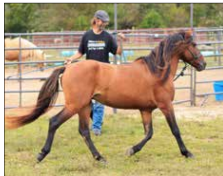
Photo: Scoundrel Days, HOA #1313; 37.5% Book Cliffs, 12.5% Grand Canyon, 12.5% Feral-Utah; 12.5% HOA Foundation; 12.5% Sulphur Mountains, 6.25% Brislawn Foundation, 6.25% Shoshoni Indian

show overlapping percentages and add up to more than 100%. For example, a Book Cliffs ancestor that was part of the early established Brislawn herd would be 100% Book Cliffs and also 100% Brislawn.