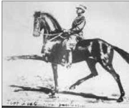
Photo: Captain Beudant on Robertsart II, a 1913 French Remount in North Africa

(The Colonial Spanish Atlas Bone, continued from page 5)