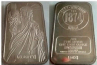
LIBERTY MTB Manfra Tordella & Brookes GARY-WHEATON Bank Circular Logo 1 Troy Oz Mintage <1,000 Known SN 0381