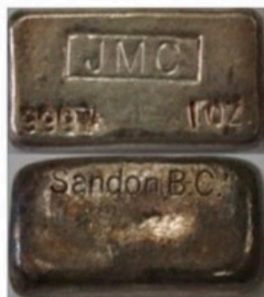
JMC Rectangular Logo Maple Leaf Logo Sandon, B.C. 1 oz example produced in the 1960's by Johnson Matthey. Produced in Sandon British Co- lumbia, Canada. Mintage <2,000