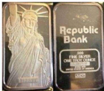
LIBERTY MTB Manfra Tordella & Brookes for Brookes Republic Bank of New York. Observed for sale at 5x spot or $50+ over spot. 1 Troy Oz Mintage <1,000 Known N 0458 05136 0797 0966