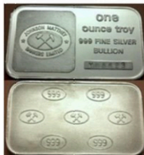
Crossed Hammers Logo Inner Oval One ounce troy silver bullion 999 1 Troy Oz Mintage <3,000 Known SN M08623 501363 501364 501365 502219 502957 506557 999 Oval Repeated Two Times, Mining Tool Oval Logo Repeated Three Times, 999 Oval Repeated Two Times