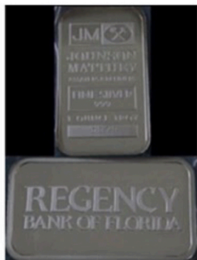
REGENCY BANK OF FLORIDA 1 Troy Oz Originally issued in blur velvet bag Mintage <1,000 Known SN 0043, 0079, 0099, 0462