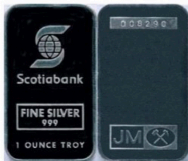
Scotiabank Custom Logo Scotiabank Smaller Logo 1 Troy Oz Mintage <500 Known SN 003650, 005560, 0088290