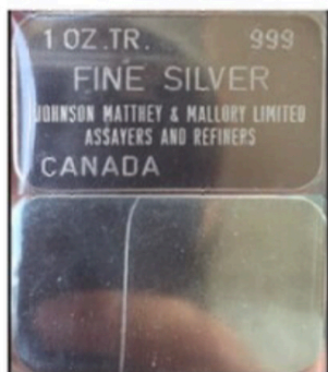
JOHNSON MATTHEY & MALLORY LIMITED BLANK REVERSE 1 Troy Oz Mintage <1,000