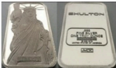
LIBERTY MTB Manfra Tordella & Brookes for Shulton of New York. Maker of Old Spice aftershave. Shul- ton was founded in 1937. 1 Troy Oz Minted in 1982 Mintage <200