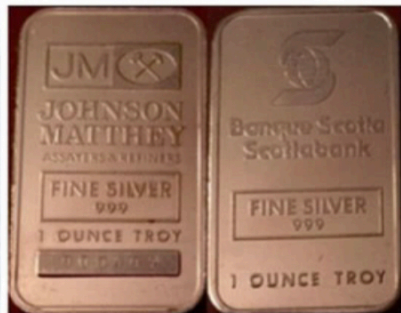
JOHNSON MATTHEY ASSAYERS & REFINERS Banque Scotia Scotiabank 1 Troy Oz Mintage <100