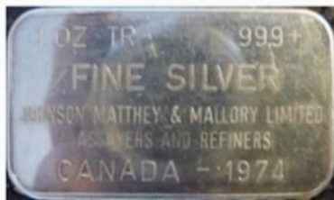
JOHNSON MATTHEY & MALLORY LIMITED ASSAYERS AND REFINERS CANADA 1 Troy Oz Mintage <100