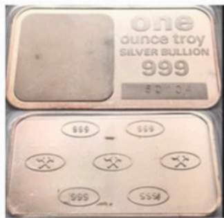
One ounce troy silver bullion 999 1 Troy Oz Mintage <10 Known SN 50104 999 Oval Repeated Two Times, Mining Tool Oval Logo Repeated Three Times, 999 Oval Repeated Two Times