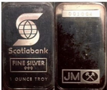
Scotiabank Custom Logo Scotiabank Large Logo 1 Troy Oz Mintage <100 Known SN 001004