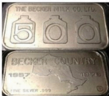
THE BECKER MILK CO LTD 500 Custom Milk Bottle Logo BECKER COUNTRY with Map Image of Ontario 1 Troy Oz Mintage <500