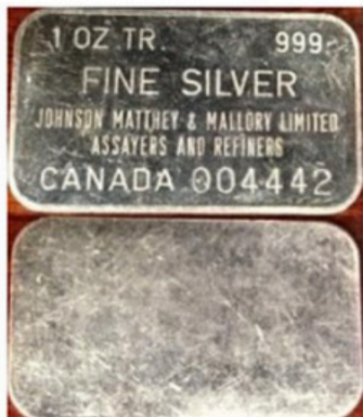
JOHNSON MATTHEY & MALLORY LIMITED ASSAYERS & REFINERS CANADA 1 Troy Oz Mintage <10,000 Known SN 002033 002582 004442 004443 006050 009256 009337