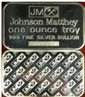
Johnson Matthey one ounce troy LONDON JM Crossed Hammers Logo Repeated Fifteen Full Times Mintage <100 Known SN 000011 000012 000013 000014 000015