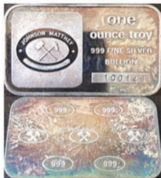
Crossed Hammers Logo Inner Oval One ounce troy silver bullion 999 1 Troy Oz Mintage <250 Known SN 100146 999 Oval Repeated Two Times, Mining Tool Oval Logo Repeated Three Times, 999 Oval Repeated Two Times