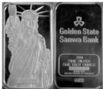
LIBERTY MTB Manfra Tordella & Brookes Golden State Sanwa Bank Custom Logo 1 Troy Oz Minted in 1982 Mintage <2,000 Known SN 00047, 00048, 01564