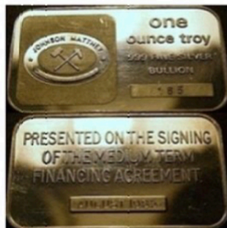
Crossed Hammers Logo Inner Oval One ounce troy silver bullion 999 1 Troy Oz Mintage <500 Known SN 185 PRESENTED ON THE SIGNING OF THE MEDIUM TERM FINANCING AGREEMENT AUGUST 1985