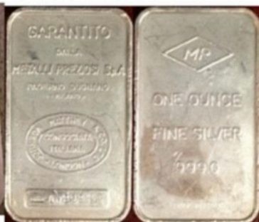
GARANTITO METALLI PREZIOSI S.p.A. JOHNSON MATTHEY & CO LTD LONDON CONSOCIATA ITALIANA 1oz MP example produced in 1980 by Johnson Matthey, London, for Metalli Preziosi S.p.A. Mintage <2,000