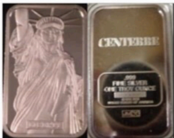
LIBERTY MTB Manfra Tordella & Brookes Produced in 1984 for Centerre Ban- corporation of St. Louis, MO. Report- edly issued with assay card. CENTERRE 1 Troy Oz Mintage <5,000 Known SN 01158, 04792