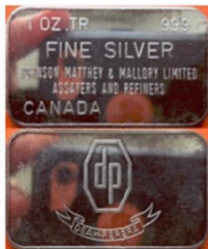
DEAK PERERA BANNER LOGO 1 Troy Oz Mintage <250