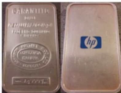
GARANTITO METALLI PREZIOSI S.p.A JOHNSON MATTHEY & CO LTD— LONDON CONSOCIATA ITALIANA Very rare example produced in 1980 by Johnson Matthey, London, for Metalli Prezi- osi S.p.A. It was produced exclusively for Hewlett Packard, and was originally issued in a presentation box. Mintage <50