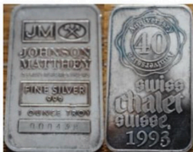
Swiss Chalet Suisse Johnson Matthey Assayers & Refiners 1 Troy Oz Minted in 1993 Mintage <100 Known SN 000439