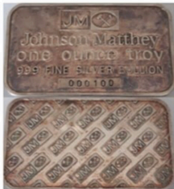
Johnson Matthey one ounce troy LONDON Thinner, less bold font, most easily observed by the letter 'B' in 'BULLION' when compared to the example to the left. JM Crossed Hammers Logo Repeated Fifteen Full Times Mintage <50 Known SN 0001000