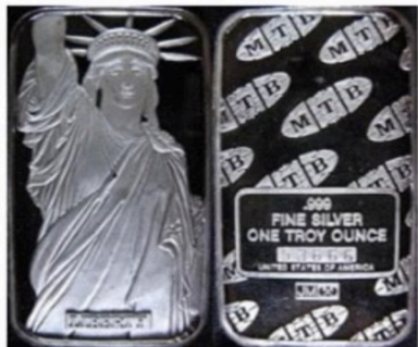
LIBERTY MTB Manfra Tordella & Brookes 1 Troy Oz Mintage <24,000 Known SN 40051, 46574, 48740, 50763, 53666, 56926