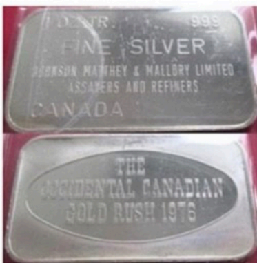
THE OCCIDENTAL CANADIAN GOLD RUSH 1976 1 Troy Oz Mintage <1,000