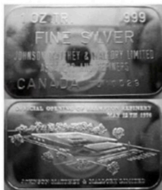
OFFICIAL OPENING OF BRAMPTON REFINERY MAY 12th 1976 IN ONTARIO CANADA 1 Troy Oz Mintage <250 Known SN 010029