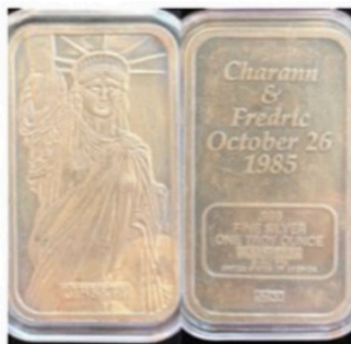
LIBERTY MTB Manfra Tordella & Brookes Charann & Fredric October 26, 1985 1 Troy Oz Minted in 1985 Mintage <500 Known SN 0078