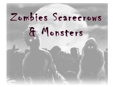
OCTOBER 15 AND 16,2021