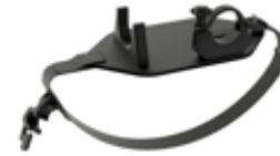
Mounting harness for kayak, canoe and SUP x1