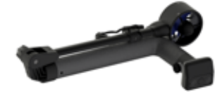
CRUISER motor X1