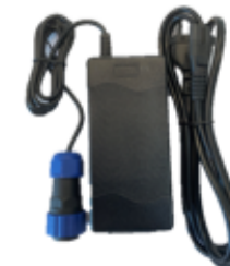
CRUISER charger 230V X1