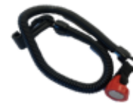
Magnetic kill switch X1 (Also works as the main switch)