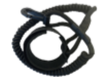
CRUISER safety cord X1