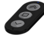
CRUISER remote X1