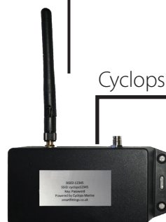
Cyclops N2K lead