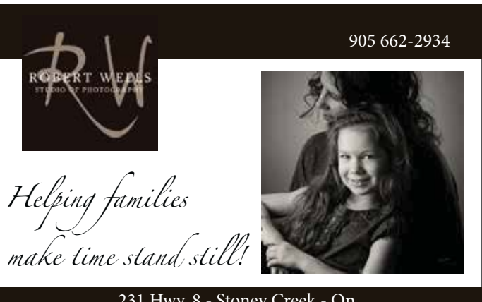
231 Hwy. 8 - Stoney Creek - On www.robertwellsphotography.com