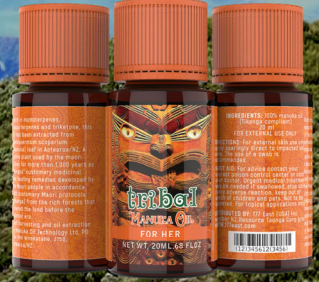
“Mānuka For Her”