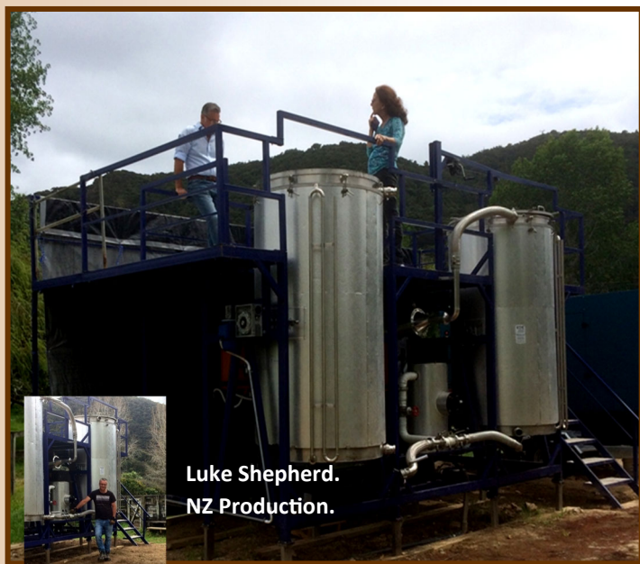
Luke Shepherd. NZ Production.

Notice of an NZD450,000 Pre-Series A Round Information Memorandum. Available only to qualifying Wholesale Investors in NZ as an excluded offer under Schedule 1 of the Financial Markets Conduct Act 2013.