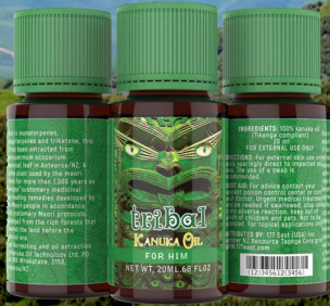
“Kānuka For Him”

AT USD2,500 PER KG RETAIL, NZ TEA TREE OIL IS THE FAR-NORTH'S AGRIBIZ SUNRISE SECTOR!