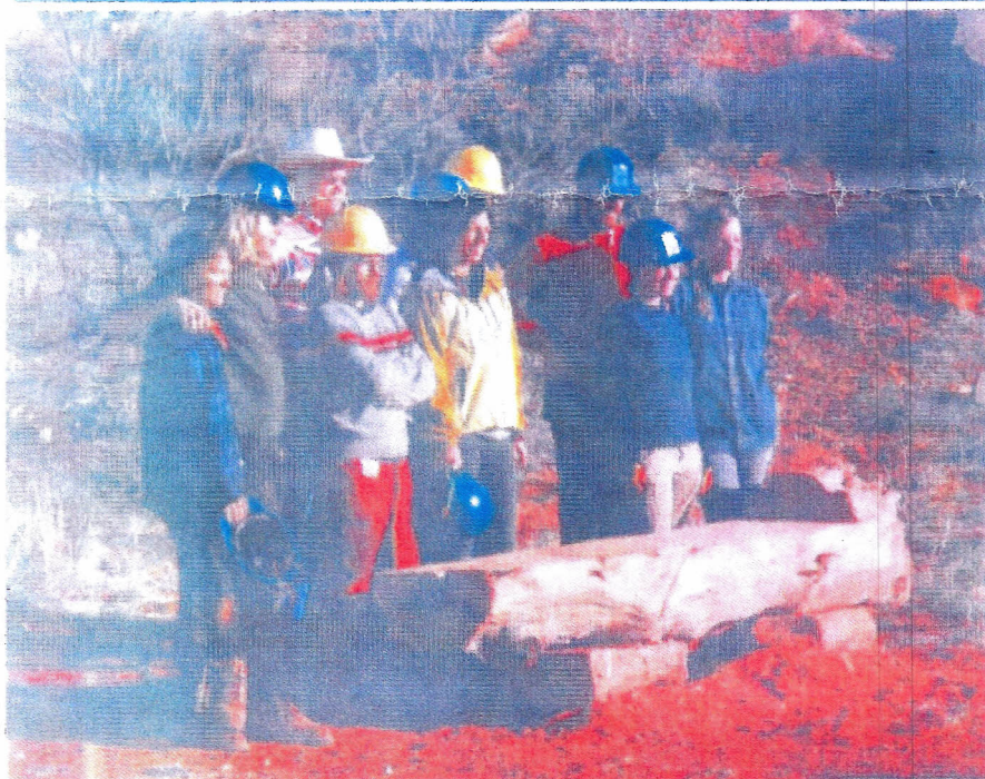
Palo Duro Canyon State Park American Youth Works