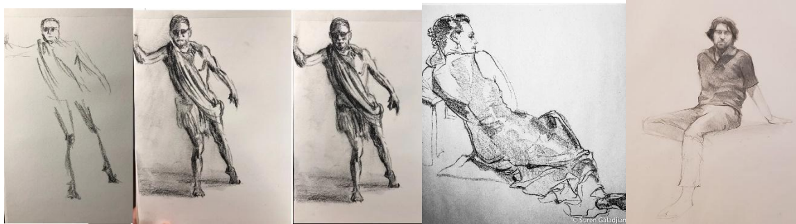
Figure Drawing Challenge