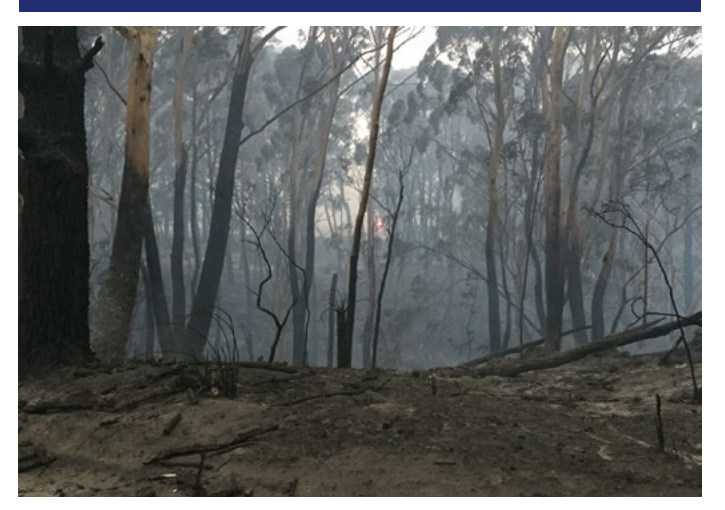
Koolilabah Lane Penrose Then? Now $