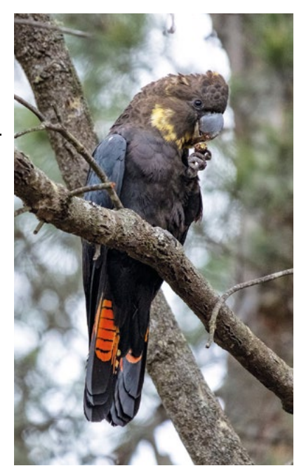
Louise (named after Louise Docker)

Adult females exhibit extensive yellow patches on their head and neck and the tail panels tend to be more orange-red with black bars, but can become more red and less barred with age.