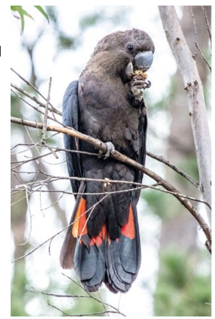
An Adult male

Young birds look similar to adult males, however they tend to have yellow spotted or streaked flanks and under-bodies, with some yellow spots on their head.