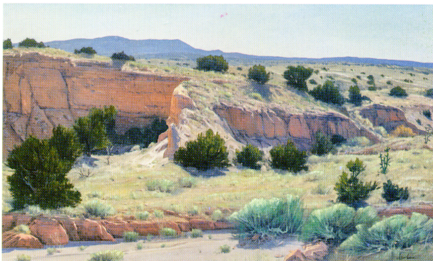
Near La Bajada, oil, 36" by 60"

"The Grand Canyon is one the most beautiful places on earth, one that I feel a deep sense of awe and diminished ego when in the presence of this geologic planetary giant. I've spent many hours, weeks, and years painting and contemplating this wonder of the world, and so I felt moved to paint my self portrait with the Temple of Zoroaster in the background, located just above and to the left of my figure."