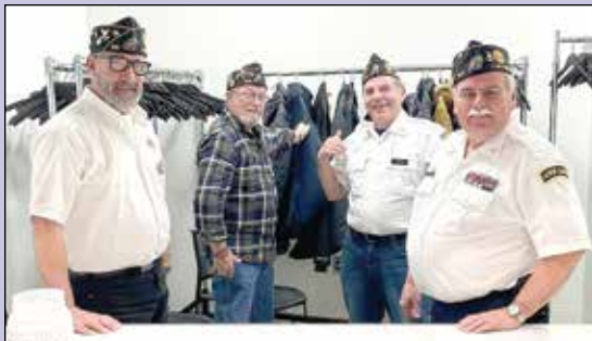
Also taking turns at the Green Bay RV & Camping Expo were Post 165 Two Rivers (above) and Post 477 St. Nazianz (below).

The event was coordinated by the Department Marketing & Communications Committee and supported by 2nd, 6th and 9th District Legion Family members who staffed the Resch Center coat room and interacted with Expo attendees and vendors.