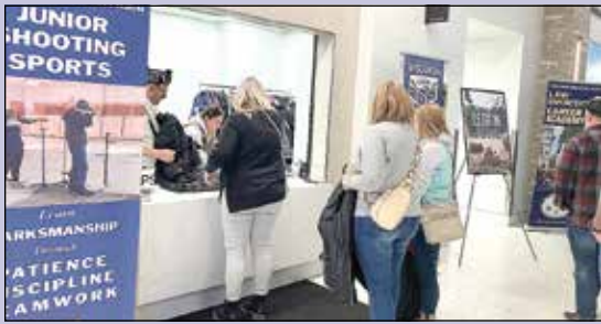
9th District members staffed the coat room at the Green Bay RV & Camping Expo at the Resch Center.