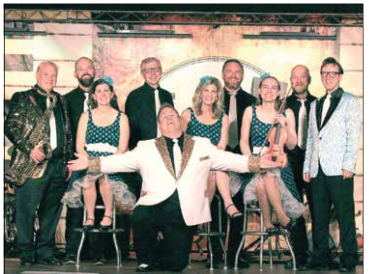
Daddy Ds Productions will perform Saturday night.