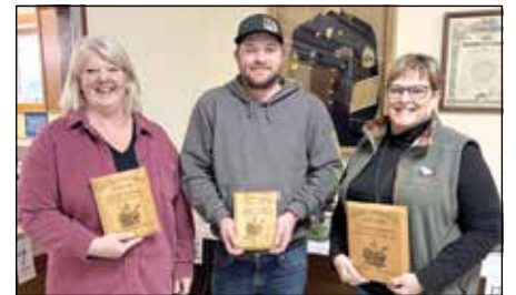
Soup contest winners pose with plaques (above) while euchre players enjoy a hand (below) during the Post 200 event.