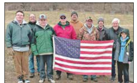
McFarland American Legion Post 534 disposed of 550 flags during a recent flag disposal ceremony.