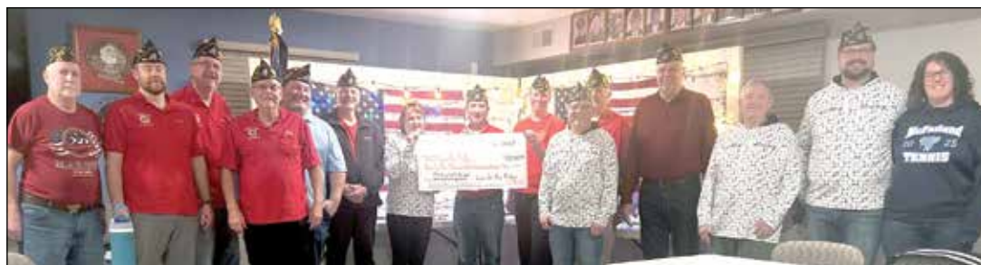
McFarland Edwards-Foye American Legion Post 534 donated to Toys for Tots.