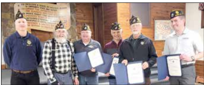
ABOVE: Members of Post 11 receiving certificates of appreciation for their service to scouting. BELOW: Members of Post 11 receiving their certificates and pins for completion of Funeral Honor Guard training.