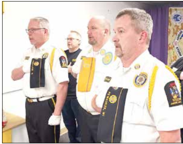
Members from Pewaukee Post 71's Honor Guard posted the Colors on January 22 at the Healing Warrior Hearts Retreat.