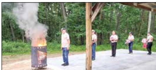
Members of Post 283 in Suring conducted flag disposal ceremony for unserviceable flags collected throughout the year.