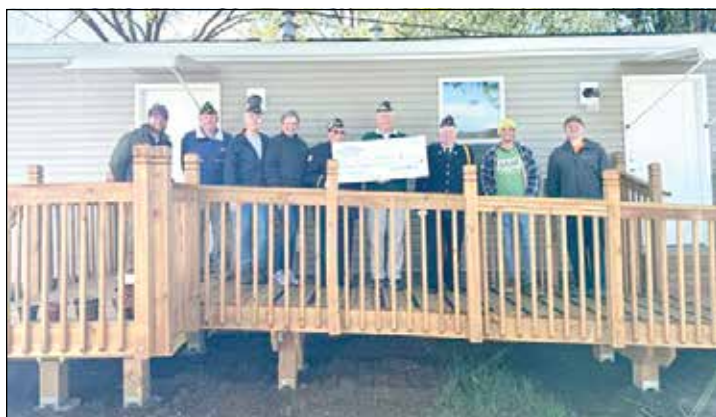
The American Legion Post 336, Habitat for Humanity and Home Depot all were involved in building a ramp for a Veteran.

Suicide Prevention is Everyone's Responsibility