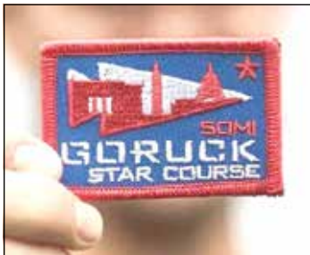
The Go Ruck Star Course Patch.

Ruck 50 Miler Star Course in Atlanta. This event finds its roots in an executive order to members of the military by Teddy Roosevelt and later echoed by JFK: "Do 50 miles in under 20 hours."