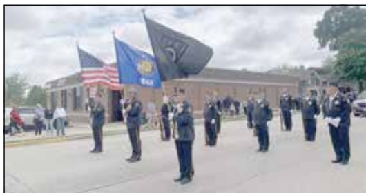
Members of American Legion Pewaukee Post 71, Aux Unit 71 and SAL Squadron 71 took part in the Memorial Day Parade in Pewaukee this year.