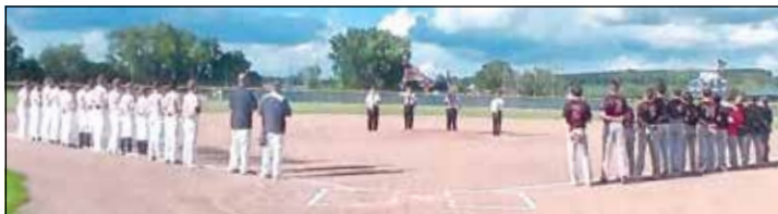
Post 395 Color Guard served at a Markesan American Legion baseball game in July.