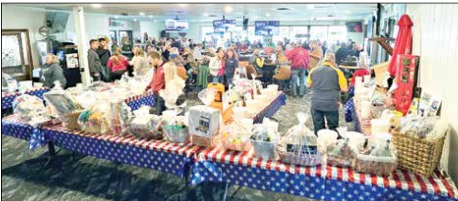
The Goetz-St. Louis Squadron 522 (Hubertus) was proud to host its 2nd annual 9-Pin Tap Bowling Tournament on Saturday, April 20, at Pioneer Bowl in Richfield, WI. The Squadron welcomed 89 bowlers who enjoyed an afternoon of fellowship, along with raffles, and, of course, bowling! Thanks to the support of the community, the Squadron was able to raise over $11,500 to support local Veterans' organizations. Many thanks to all those who participated, and the Squadron looks forward to doing it again in 2025!