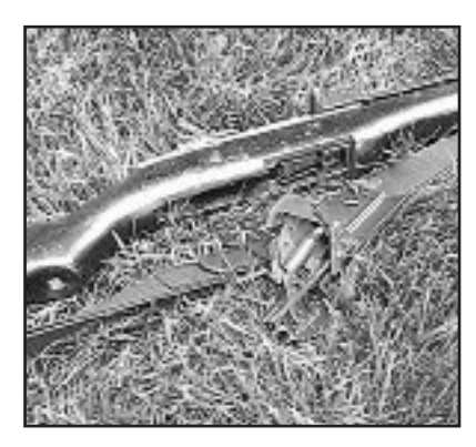
cartridge (6 crimps)

Do not fire .30 caliber grenade cartridges in the M1 Garand rifle.