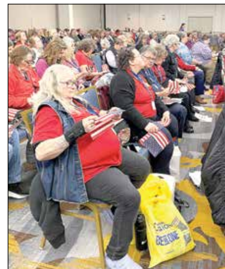
Members folding pocket flags as demonstrated by the Junior members.