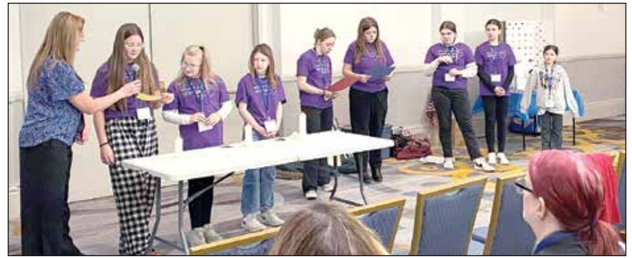
Junior Auxiliary Members performing a Membership skit.