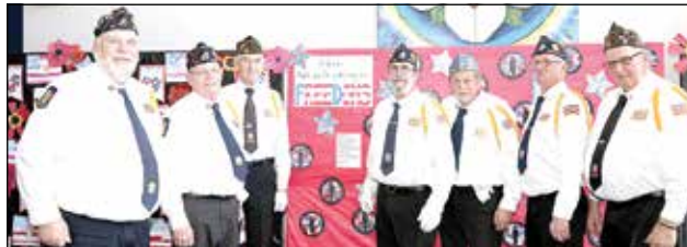
ABOVE: Neenah American Legion Post 33 and Squadron 33 presented colors at Shattuck Park in Neenah on Veterans Day.