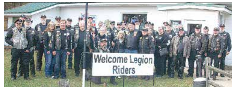
The Legion Riders held a meeting at Montello Post 351 on November 2. Post 351 provided the use of our hall and served a meal for them.