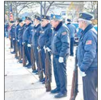
AT RIGHT: Neenah American Legion Post 33 and Squadron 33 presented colors at New Hope School in Neenah on Veterans Day.