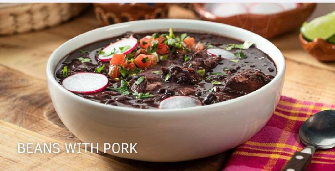
BEANS WITH PORK

You can also find elements of Yucatecan cuisine, with corn being the main ingredient. The most commonly used condiments and spices include pumpkin seeds, oregano, purple onion, bitter orange, sweet pepper, lime, tomato, annatto, xkatik chili, and habanero chili. Among the most representative dishes of Yucatecan cuisine, we have beans with pork, stuffed cheese, lime soup, salbutes, panuchos, papadzules, and cochinita pibil.