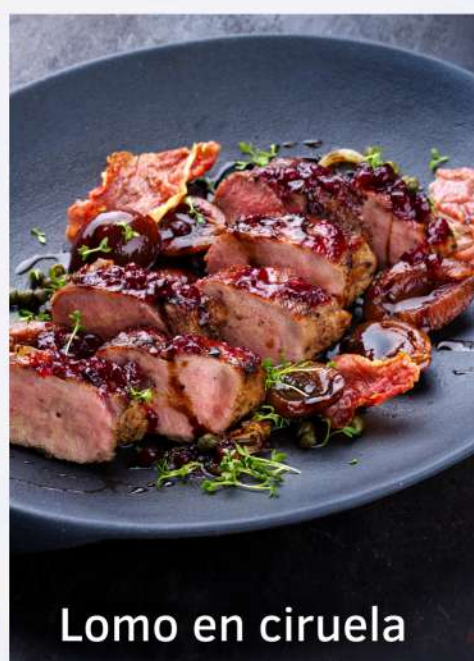
Lomo en ciruela