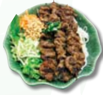
22. Grilled honey lemongrass pork Bún Thịt Nướng 14.50 GF