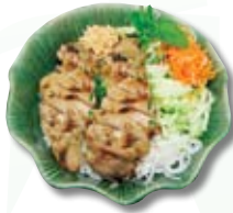
21. Grilled honey lemongrass chicken Bún Gà Nướng 14.50 GF