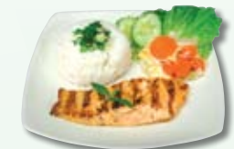
38. Grilled salmon Cơm Salmon Nướng 18.95