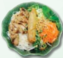
27. Grilled honey lemongrass chicken & spring roll Bún Chả Giò Gà Nướng 14.75