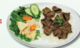
39. Grilled honey lemongrass tenderloin beef steak Cơm Bò Nướng 17.95 GF