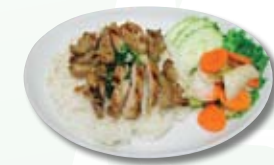
35. Grilled honey lemongrass chicken Cơm Gà Nướng 14.50 GF