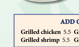
➤ 63. Thai curry shrimp GF Cơm Cà Ri Tôm 15.95