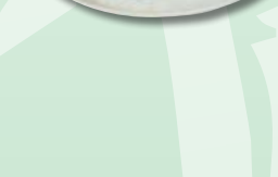
71. Spicy cashew nut chicken 15.25