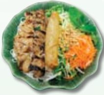
25. Grilled honey lemongrass chicken pork & spring roll Bún Chả Giò Gà Nướng Thịt Nướng 16.95