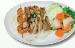
36. Grilled honey lemongrass chicken & shrimp Cơm Gà Tôm Nướng 14.95