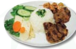
32. Grilled pork chop and grilled shrimp Cơm Sườn Tôm Nướng 16.50