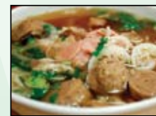
Our most popular

Our beef comes with the choicest cuts of meats, and rice noodles in a bowl of our delicate beef broth, with the herbs & spices, served with a side of bean sprouts, jalapenos & Asian basil