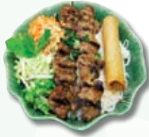
24. Grilled honey lemongrass pork & spring roll Bún Chả Giò Thịt Nướng 14.75