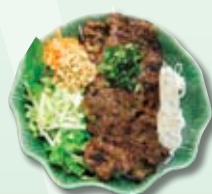
29. Grilled honey lemongrass tenderloin beef steak Bún Bò Nướng 17.95 GF