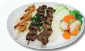
33. Grilled shrimp and honey lemongrass pork Cơm Tôm Thịt Nướng 14.95