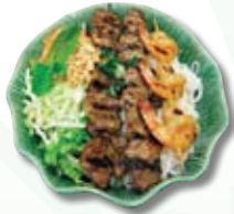
23. Grilled shrimp & honey lemongrass pork Bún Tôm Thịt Nướng 14.95