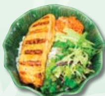
30. Grilled salmon Bún Salmon Nướng 18.95