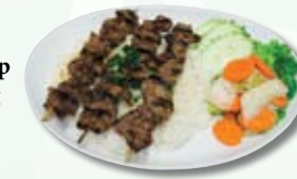
37. Grilled honey lemongrass pork Cơm Thịt Nướng 14.50 GF