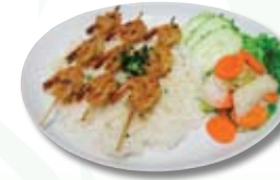
34. Grilled shrimp Cơm Tôm Nướng 14.95