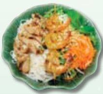
28. Grilled honey lemongrass chicken & shrimp Bún Gà Tôm Nướng 14.95