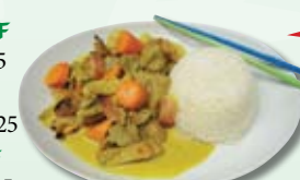
➤ 61. Thai curry chicken GF Cơm Cà Ri Gà 14.95