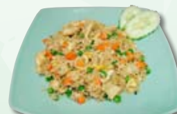
➤ 51. Chicken fried rice GF Cơm Chiên Gà 14.25