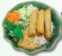
26. Crispy vegetarian spring rolls or fried tofu Bún Chả Giò Chay Hoặc Đậu Hủ Chiên 13.95