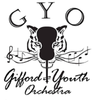
STRINGS, PIANO, DRAMA, VOICE, DANCE

Our mission to increase public safety by reducing juvenile delinquency through effective prevention, intervention and treatment services that strengthen families and turn around the lives of troubled youth.