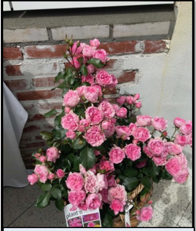
'I Am Grateful' Another new rose variety from Forever Roses