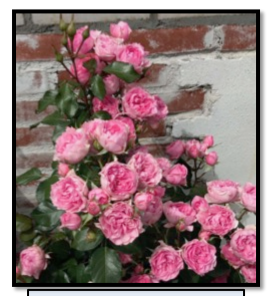
'I Am Grateful' A variety from Forever Roses.