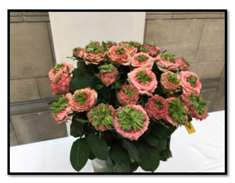
'Green Island Fantasy' from Tantau