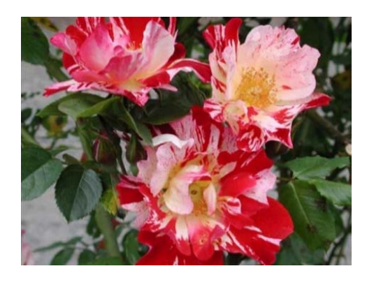
Dortmund Fourth of July

Take a look as you walk through your garden, I bet you will see find rose hips in all sizes. Clip a few of these rose hips to make a nice arrangement for you home.