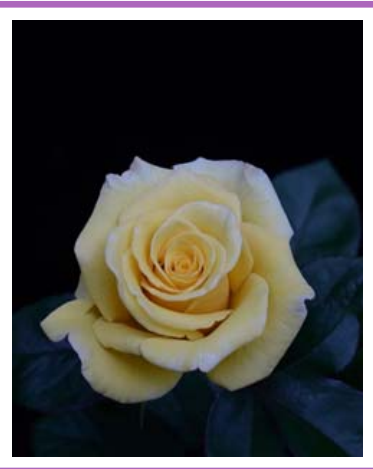
Class 16 Photography Rose Garden View Joe Plunkett