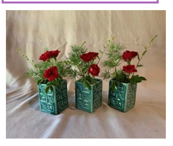
Class 22 Miniature East Asian Design Solitude Andy Black

Class 20 Miniature Modern Design Weeding Again, and Again, and Again Andy Black