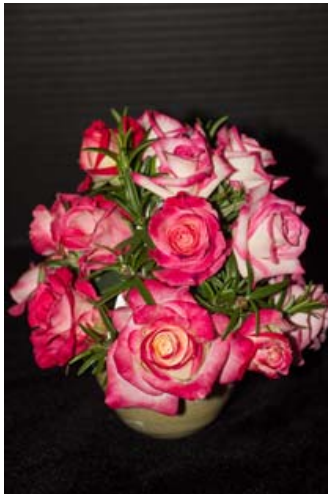
Class 20 Miniature Traditional Design Dawn in the Rose Garden Debra Bagley