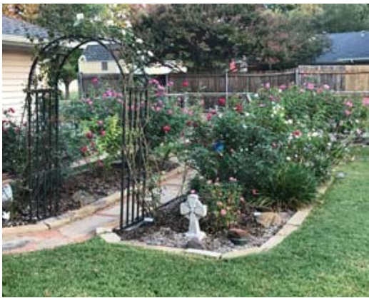
Class 16 Photography Rose Garden View Joe Plunkett