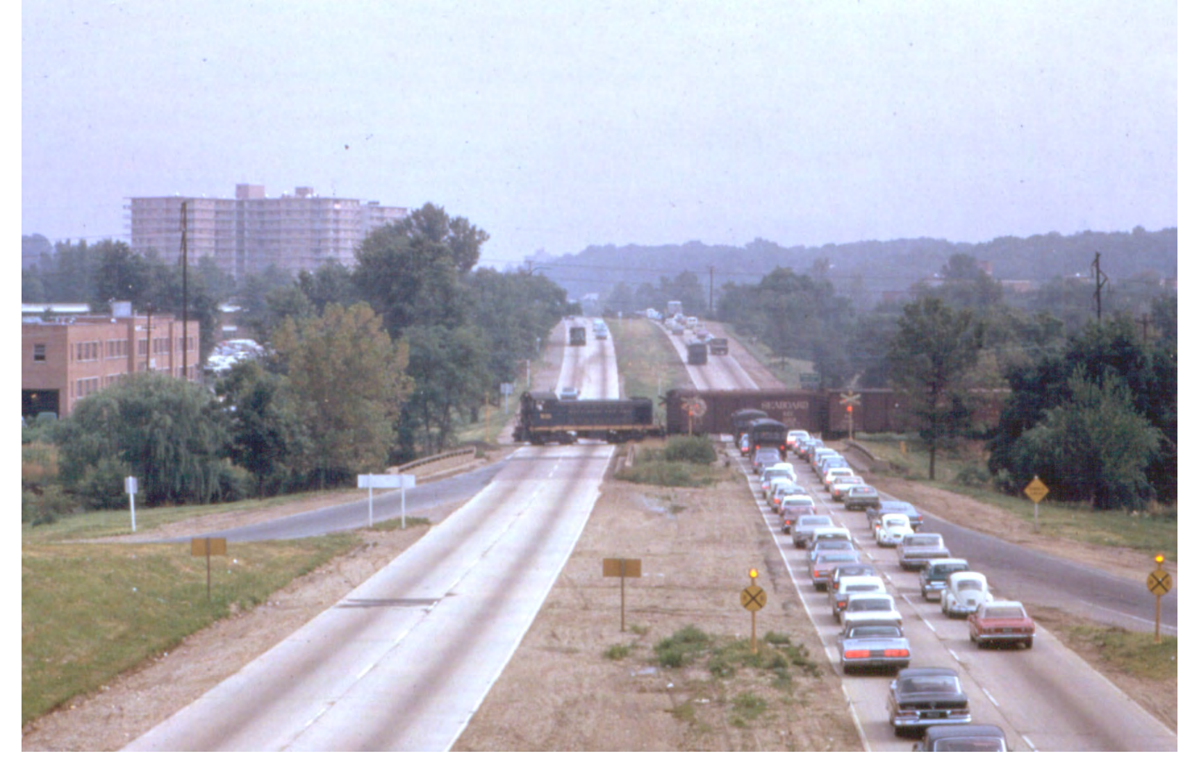
W&OD Railroad Abandoned August 1968