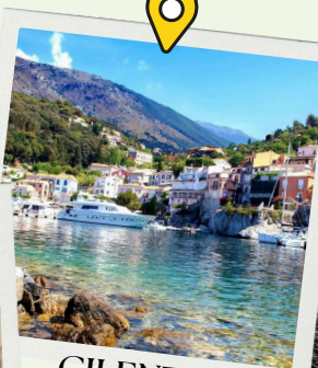
CILENTO & MARATEA