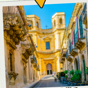
VAL DI NOTO