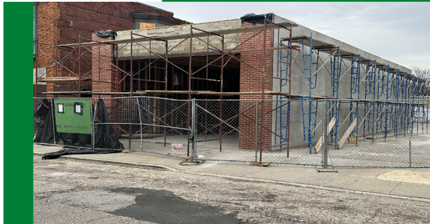
As of April 15, 2025, this is the appearance of the AWF Food Distribution Center.