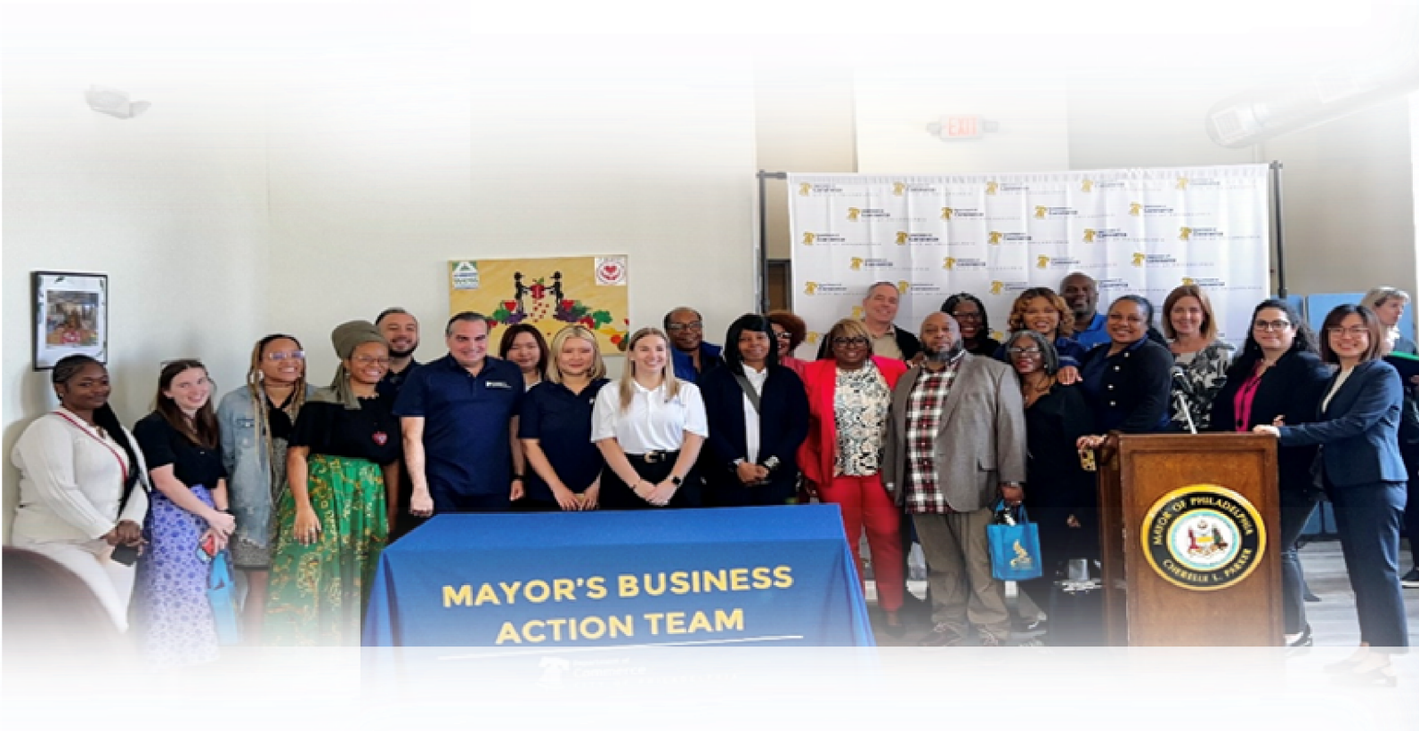
Pictured here is the City of Philadelphia Department of Commerce Dream Team. They are the people who make up the Mayor's Business Action Team. They're located at 1515 Arch Street in Center City Philadelphia, on the 12th floor. The phone number is 215-683-2000.