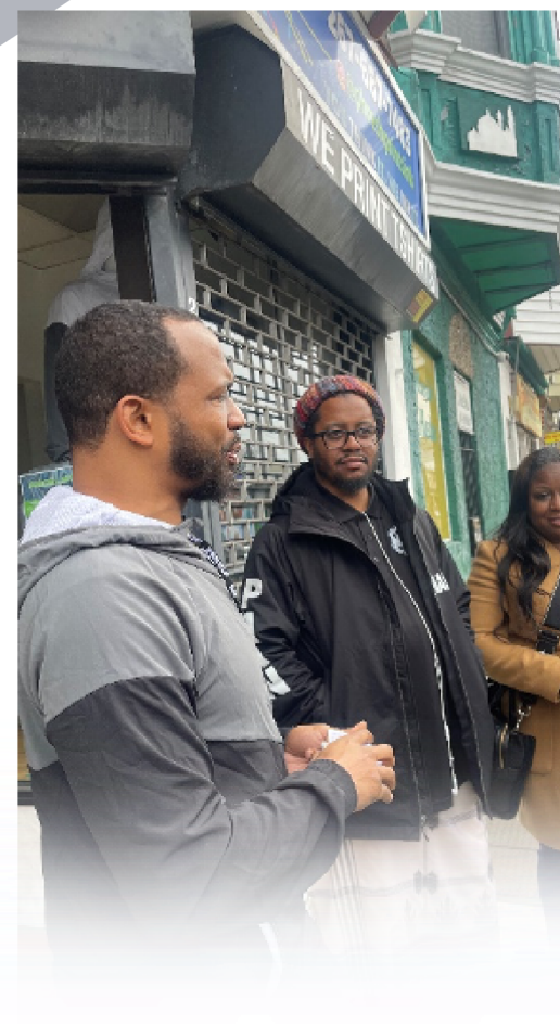
These photos reflect the visit of our Commerce Director to N. 22nd St. Feb. 23, 2024. She dived in 100% with interest.