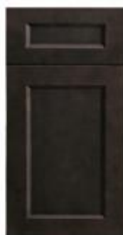
ESCADA VINTAGE WOOD (Natural Interior)