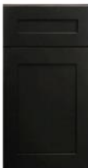
CHARCOAL BLACK SHAKER (Natural Interior)