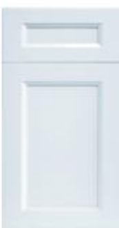
ESCADA WHITE (Natural Interior)