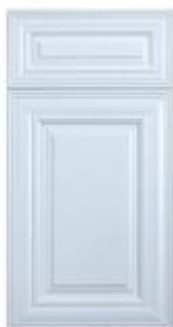
CLASSIC WHITE (Natural Interior)