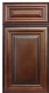
CLASSIC CHOCOLATE (Painted Interior)