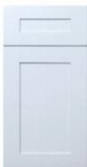
SHAKER WHITE (Natural Interior)