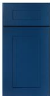
NAVY BLUE SHAKER (Natural Interior)