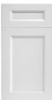
ESCADA DOVE (Natural Interior)