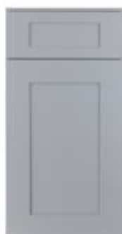
SHAKER GRAY (Painted Interior)