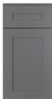
PEBBLE GRAY (Natural Interior)