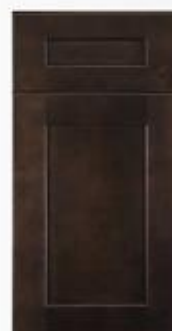
SHAKER ESPRESSO (Natural Interior)