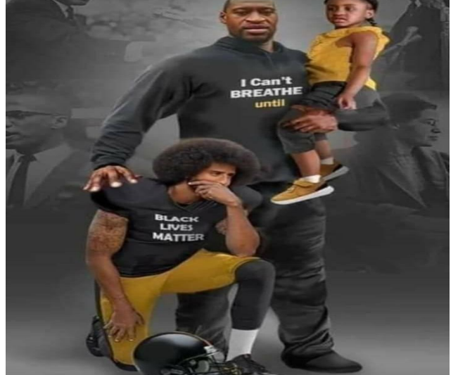
HBCU ATHLETES FILES RACIAL DISCRIMINATION LAWSUIT AGAINST NCAA