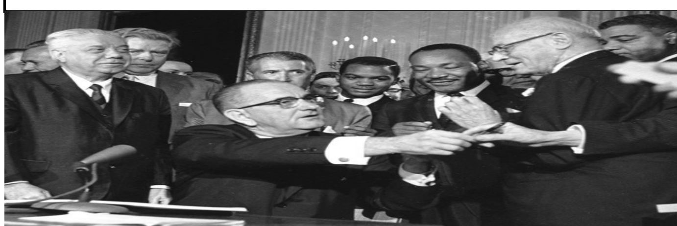
Picture of President of Lyndon Johnson signer of the 1964 Civil Rights Act with stakeholders including Martin Luther King Jr. looking on