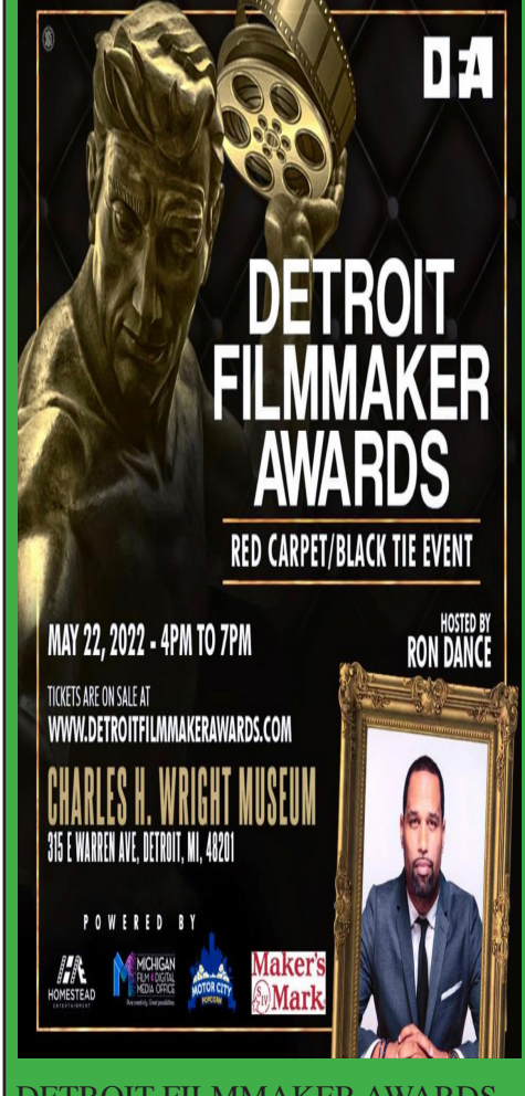
DETROIT FILMMAKER AWARDS Charles Wright Museum 4PM-7PM Sunday, May 22, 2022. (above)