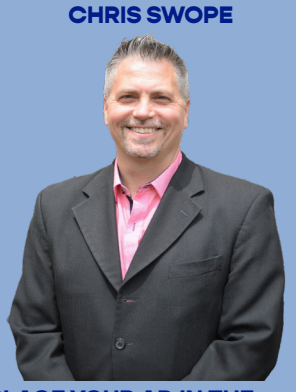
PLACE YOUR AD IN THE NEW MICHIGAN BULLETIN