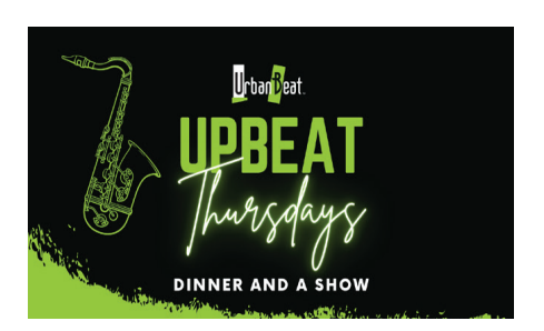
UPBEAT THURSDAYS DINNER AND A SHOW