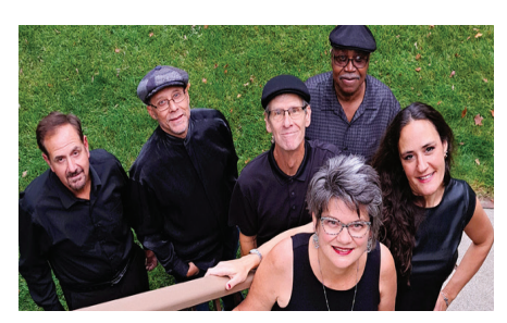
Z COLLECTIVE MOTOWN SHOW