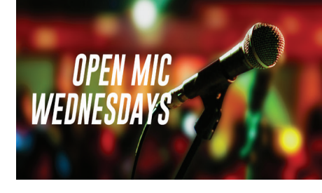
OPEN MIC NIGHT WITH RICK HANSEL