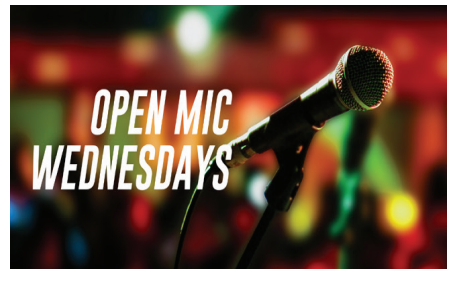
OPEN MIC NIGHT WITH RICK HANSEL