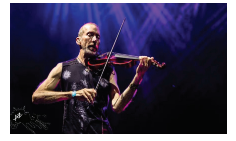
DIXON'S VIOLIN THU