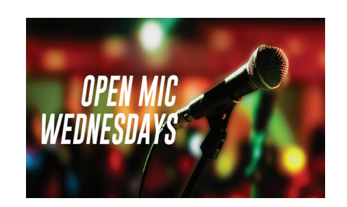
OPEN MIC NIGHT WITH RICK HANSEL