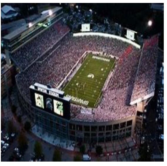
Spartan Stadium

Fans have an opportunity to make a virtual appearance in the stadium, however, by purchasing cutouts to be placed in the stands for television viewers. MSU will place cutout photos of fans in the stands for a price. Cutouts placed on the side-