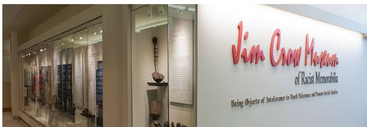
Jim Crow Museum of Racist memorabilia-Using objects of intolerance to teach and promote social justice at Ferris State University

The Jim Crow Museum is open and is FREE to the public. The Museum features six exhibit areas -- Who and What is Jim Crow, Jim Crow Violence, Jim Crow and Anti-Black Imagery, Battling Jim Crow Imagery, Attacking Jim Crow Segregation, and Beyond Jim Crow. The Museum also offers a comprehensive timeline of the African American experience in the United States. The timeline is divided into six sections: Africa Before Slavery, Slavery in America, Reconstruction, Jim Crow, Civil Rights and Post Civil Rights. The Jim Crow Museum at Ferris State University strives to become a leader in social activism and in the discussion of race and race relations. This facility will provide increased opportunities for education and research. Please join us as we embark on this mission. Regular hours are Monday thru Friday 12-5 p.m. Extended hours will be every other weekend from 12-5 as the campus calendar allows. Please consult the calendar . Group tours, please continue to make an appointment. To schedule a tour, please contact the museum at (231) 591-5873 or at jimcrowmuseum@ferris.edu . Please refer to the calendar of events for availability.